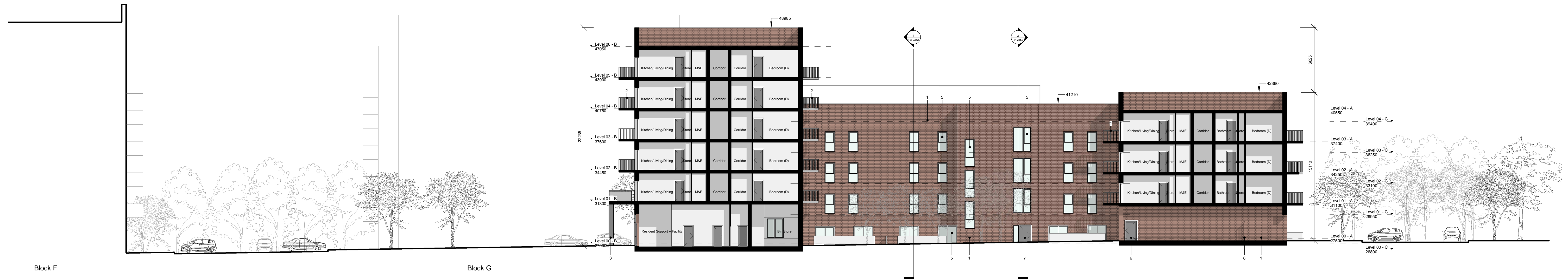
2 Block E - Section South 1 : 200