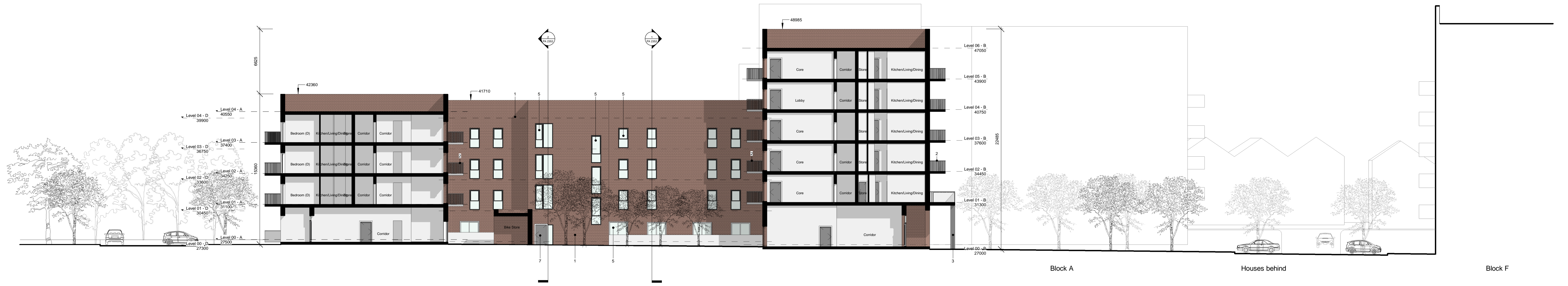
1 Block E - Section North 1 : 200